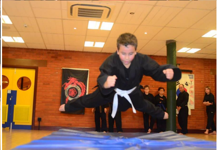
Lots more pics on Facebook!!