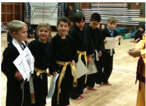
Behaved really well and even did sword sparring.